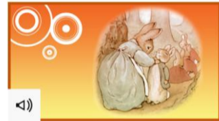
1. The Tale of Peter Rabbit Peter Rabbit stuffs himself with food from Mr McGregor's garden. But he is spotted...

https://www.bbc.co.uk/teach/school-radio/articles/zkq8f4j